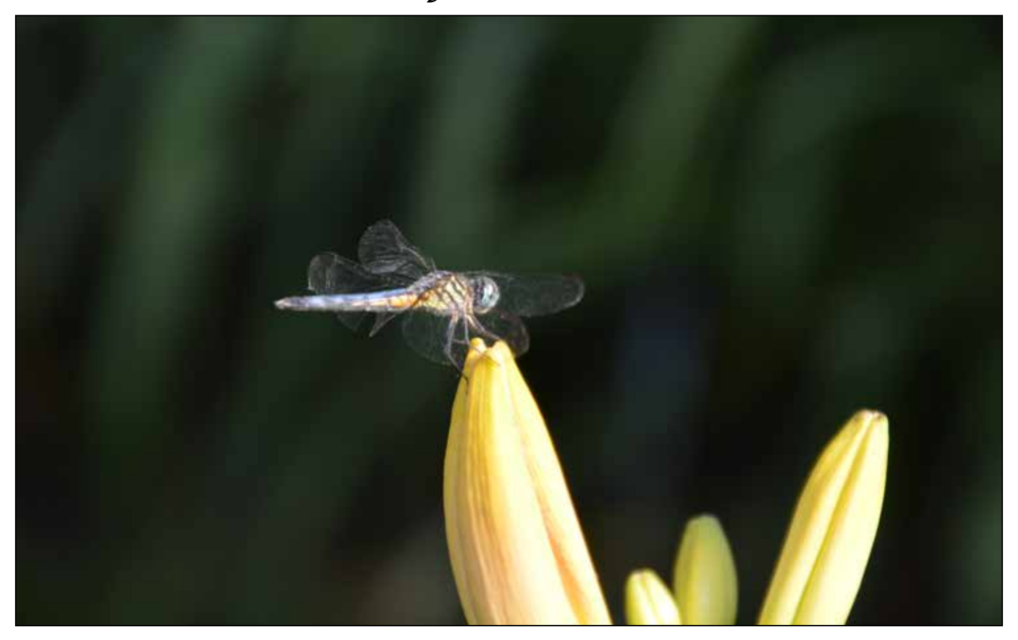
Artistic Division, "Dragonfly on Daylily Bud"