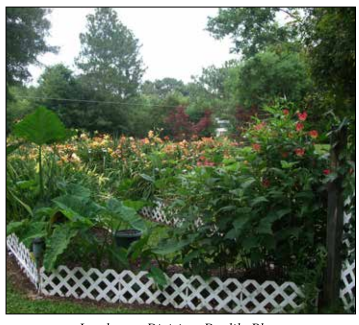
Landscape Division, Daylily Place Winning