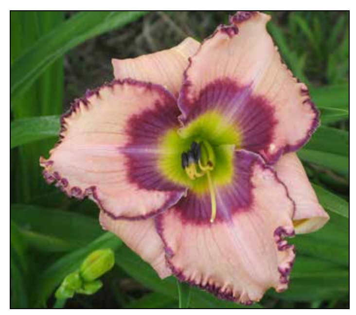
Youth Division, H. 'I See You' (Grace-L. 1999) Winning